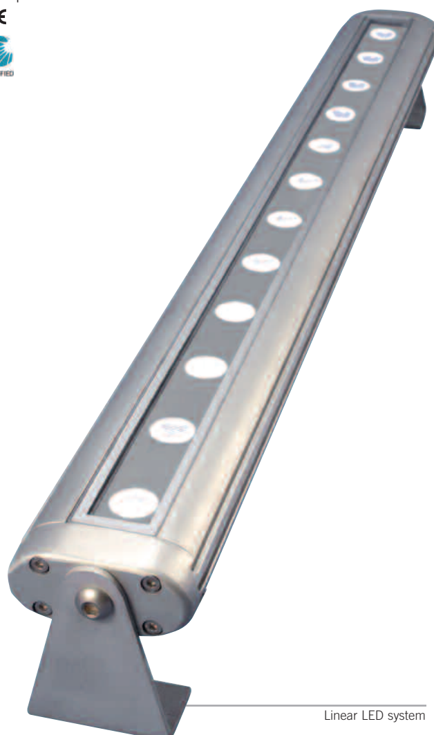
Linear LED system