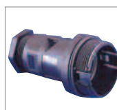
LED.ILC IP68 Wiring Connector